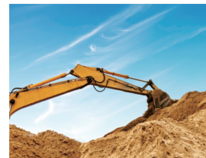
| GRADING SLOPES