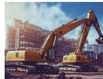
| FOUNDATION EXCAVATION