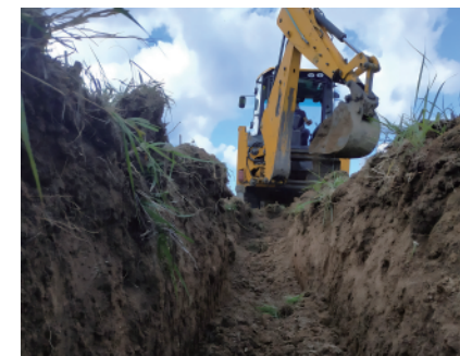
| TRENCH DIGGING