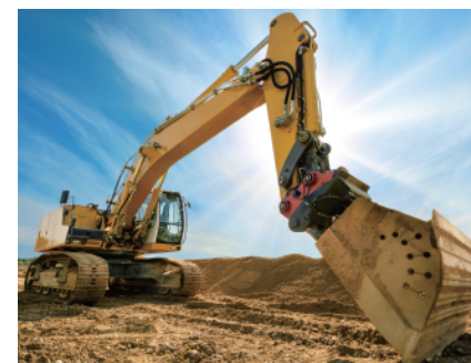
| LEVELING TRENCHES