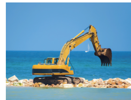
| UNDERWATER OPERATION