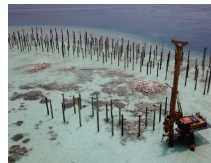
| HIGH-ACCURACY PILING