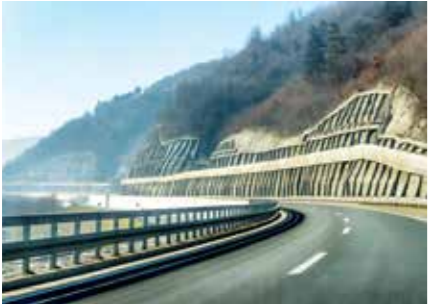
(Railway) Tunnel/Railway Slope