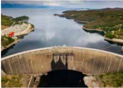
(Hydropower) Reservoir Dam